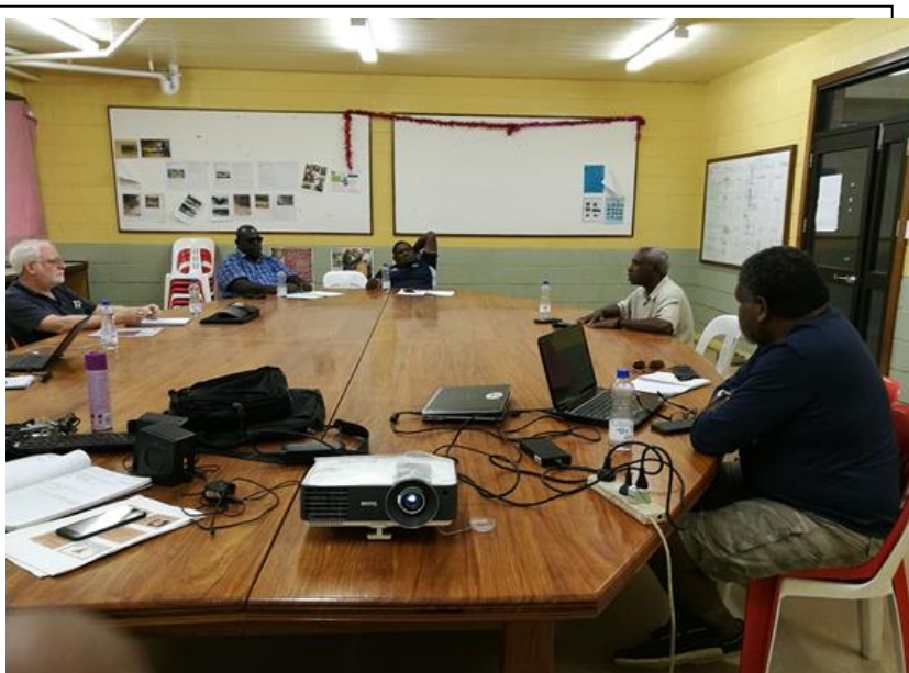
Listening to experiences from a representative from Gazelle Restoration Authority and how it became successful in the end.